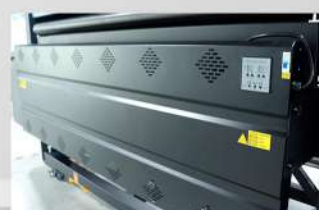
恒温自动烘干系统 Constant temperature automatic drying system