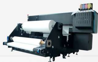
万米收送系统 (选配) 10000m take-up and feeding system (optional)