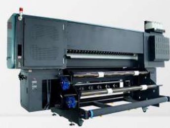
千米收送系统 (标配) 3000m take-up and feeding system(default)