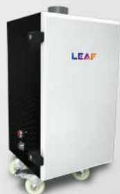
DTF Purifier LF-30F

1. Configure i1600 dual head high-speed printing